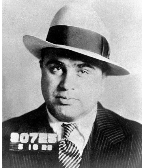
Al Capone's 1929 Philadelphia mug shot Public Domain

Censorship is the death knell of democracy